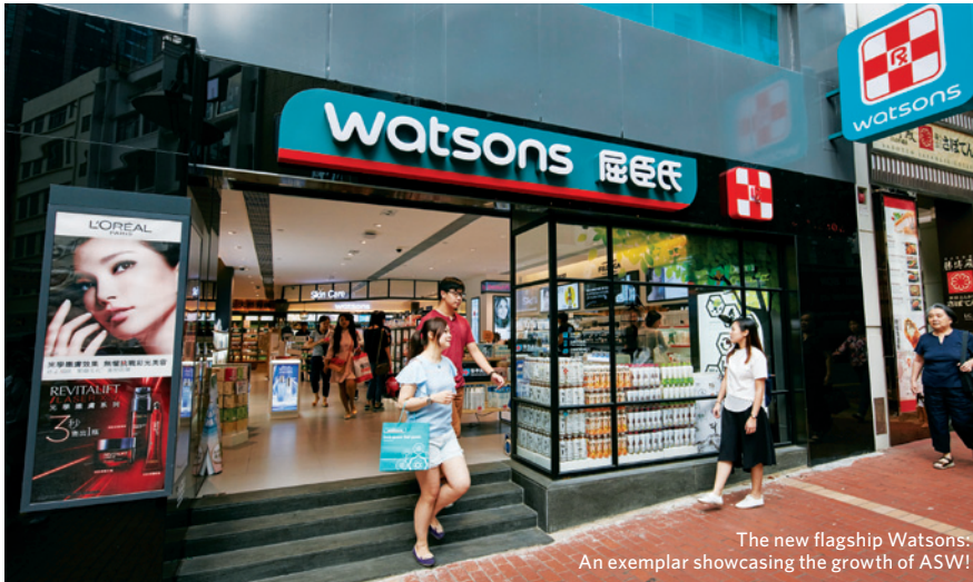
The new flagship Watsons: An exemplar showcasing the growth of ASW!

“Hong Kong has a special place in our hearts. We will continue to invest in the city.”