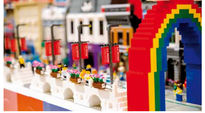
The building blocks for another 175 years of success are cemented through the strong relationship between ASW and its partners.

new initiatives and the evolution of its vision. That evolution has seen a new dimension - Innovation - spliced into the ASW DNA, adding to the pre-existing building blocks of Passion, Teamwork, Commitment and Science.