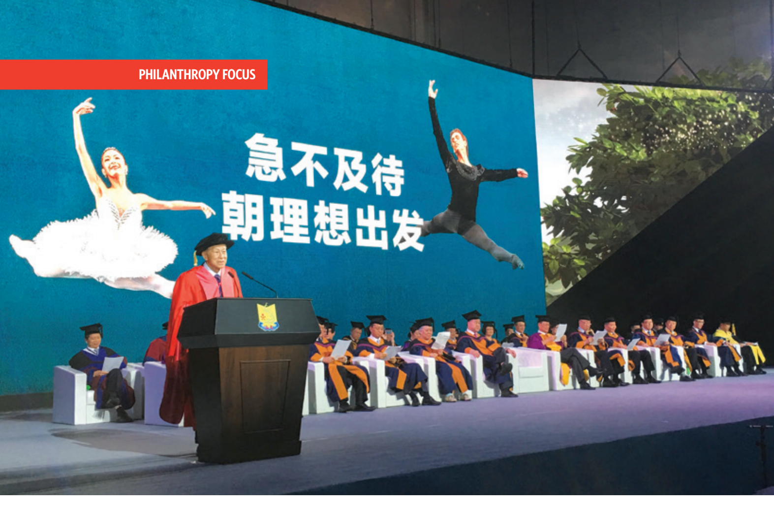
Mindful leaders shape new destinies for humanity. Like ballet dancers, their transcendence results from a struggle that shapes their personality and virtuosity.