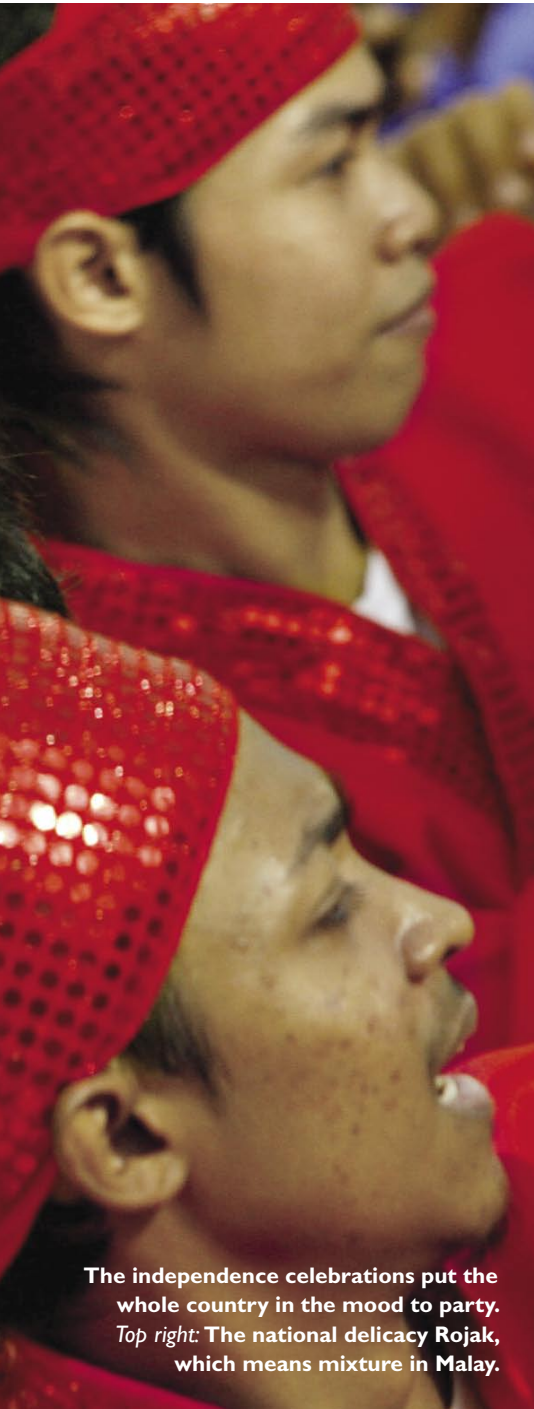
The independence celebrations put the whole country in the mood to party. Top right: The national delicacy Rojak, which means mixture in Malay.

In the colonial age, the Portuguese, then the Dutch and eventually the British found the sea trade routes around Malacca and the neighbouring ports of Penang