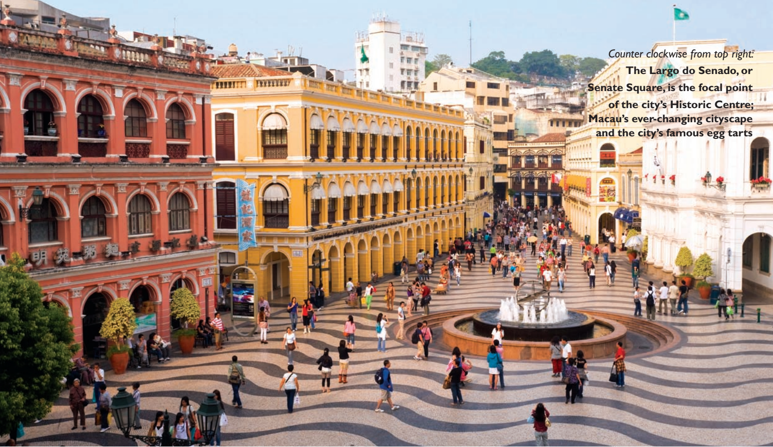
Counter clockwise from top right: The Largo do Senado, or Senate Square, is the focal point of the city's Historic Centre; Macau's ever-changing cityscape and the city's famous egg tarts