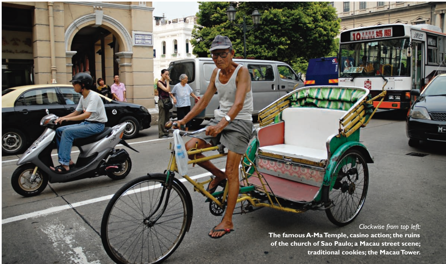
Clockwise from top left: The famous A-Ma Temple, casino action; the ruins of the church of Sao Paulo; a Macau street scene; traditional cookies; the Macau Tower.

In the words of UNESCO, Macau bears witness to one of the earliest and longest lasting encounters between China and the West based on the vibrancy of international trade