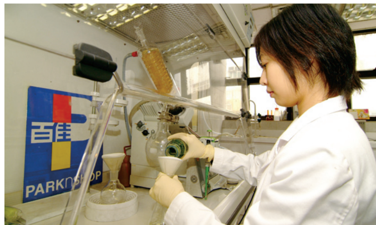
Clockwise from top left: The laboratory at Sheung Shui, Hong Kong; seafood stall and meat counter at PARKnSHOP; checking toxin levels in the laboratory; fresh fruit counter in a PARKnSHOP Superstore.