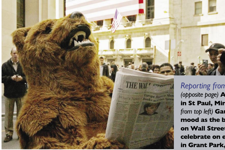
Reporting from the front line: (opposite page) A demonstration in St Paul, Minnesota. (Clockwise from top left) Gauging the public mood as the bears triumph on Wall Street; children celebrate on election night in Grant Park, Chicago; interviewing members of the Chinese community.