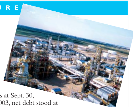
As at Sept. 30, 2003, net debt stood at C$1.2 billion, down 40% from C$2.1 billion on Dec. 31, 2002.

Production averaged 300,200 barrels of oil equivalent (boe) per day, compared with 305,100 boe per day in Q3 2002, a decrease of 2%, mainly due to divestitures, turnarounds at producing facilities and natural reservoir declines. Husky's net earnings for the first nine months of 2003 were C$1.1 billion or C$2.60 per share (diluted) compared with C$562 million or C$1.31 per share (diluted) in the first nine months of 2002, an increase of 91%. Husky's debt meanwhile decreased by C$834 million.