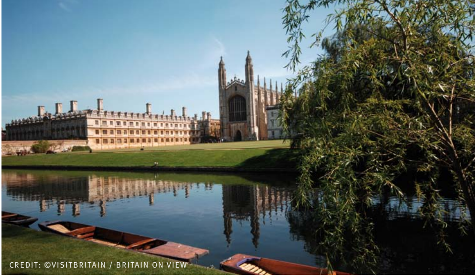
River Cam, King's College, University of Cambridge, Cambridge, UK.