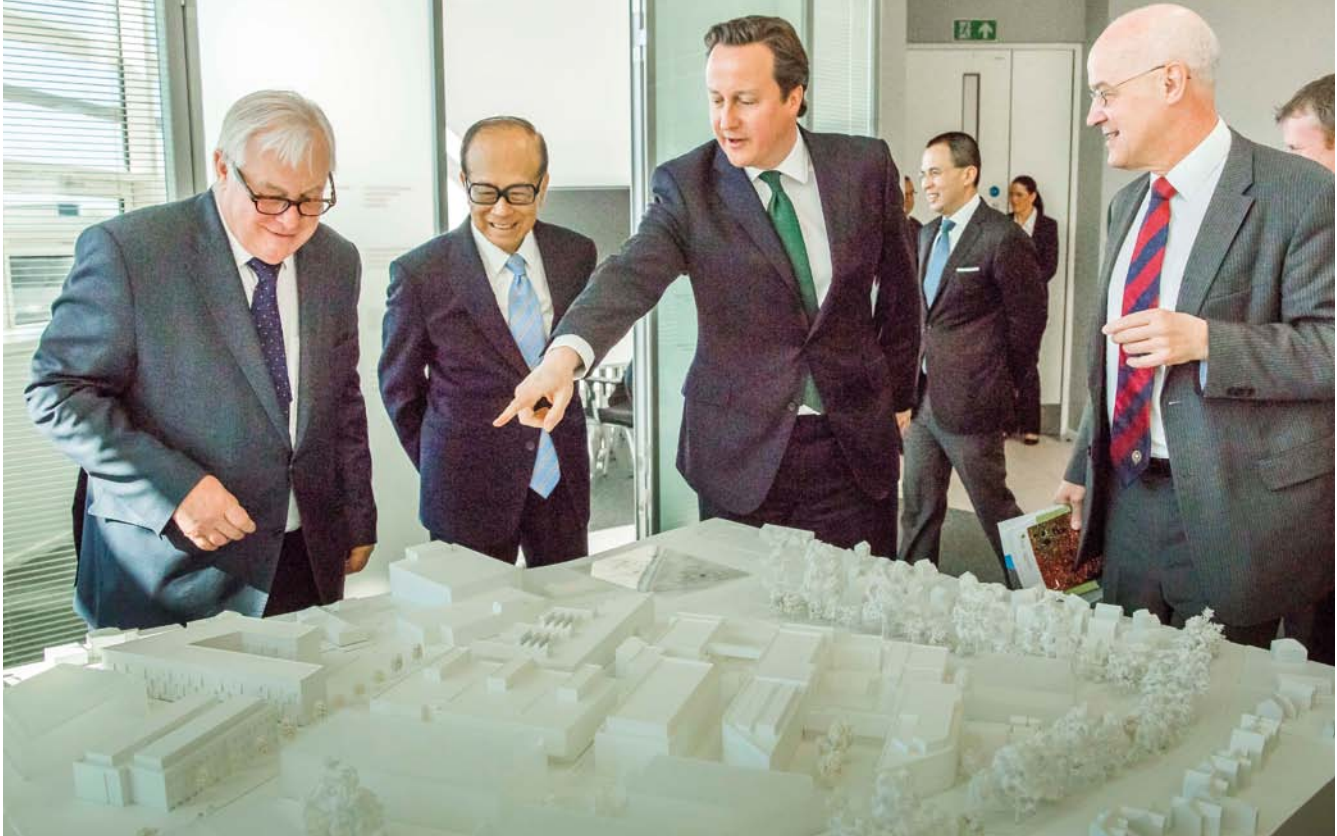
(Above) UK Prime Minister, David Cameron, sharing his passion and vision for the Foundation's development. (Bottom Right) All smiles as discussions continue with this GBP 20 million project.

The first phase of the Centre is the Target Discovery Institute, which will house research-generating comprehensive data about disease using genomic and chemical screens, which is important for the early stages of drug discovery. It aims to make use of genomic and genetic medicine to more accurately identify good drug targets for industry to pursue. Poor target selection is one of the most important reasons for setbacks in the pharmaceutical industry. The Institute will use novel technology for target identification within the university environment and hence provide the necessary academic backing to the industry.