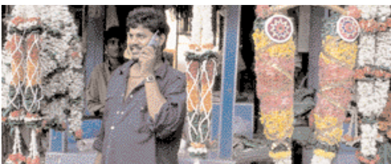
The mobile phone has entered all walks of life in India, serving as a valuable communications tool for both business and leisure.

phone has drastically altered the lifestyles of the people of India, and Hutchison has been a driving force behind this change.