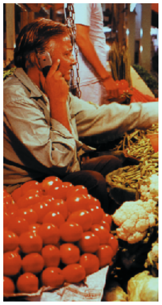
Perseverance in a difficult market has borne fruit for Hutchison.

For example, the innovative Voice Recognition Service enables subscribers in Mumbai to access real-time news, stock market information, and cricket scores via a single number. The product has been developed using a cutting-edge platform that allows users to interact with the system in a manner closely resembling human conversation. The user-friendly interface hides the complexity of the technology, which allows the system to be navigated using common words, like "cricket." More than