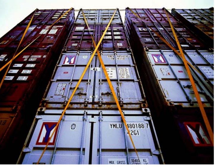
As storms approach Hong Kong during the typhoon season, which typically runs from May to September, containers are securely lashed at HIT.